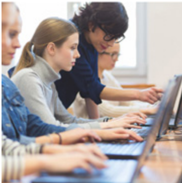
Learning skills teacher