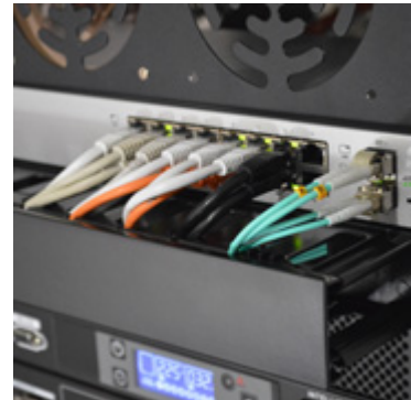
IT solutions technicians